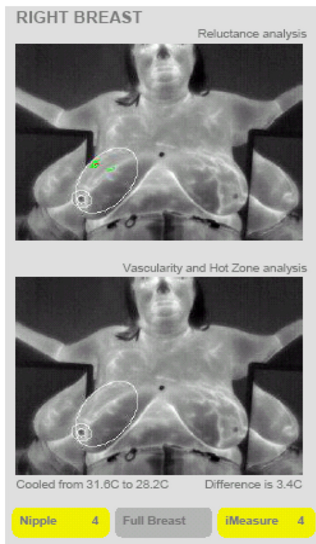
Figure 2. NoTouch BreastScan in a 43 year old woman with a 15 mm grade 2 invasive ductal cancer (no-specific type) in the upper outer quadrant of the right breast. The nipple temperature is elevated (score 4) and the upper scan shows an area that is reluctant to cool down at the site of the tumour despite good overall cooling of the breast from 31.6 °C to 28.2 °C.

The results are therefore based on a total of 106 biopsies performed in 100 women with an average age of 57 (range 33–87). Of the 106 biopsies 65 were malignant (invasive: n = 62 ; in situ: n = 3 ) and 41 were benign. Of the 65 patients with a malignant biopsy, 42 presented following routine mammographic screening. The 62 invasive cancers were graded as I ( n = 13 ), II ( n = 35 ) and III ( n = 14 ) and the mean invasive tumour size was 19 mm (range 1–48 mm). Of the 62 invasive cancers 9 were associated with lympho-vascular invasion and 57 were oestrogen receptor positive. Benign biopsy results included fibroadenoma ( n = 22 ), fibro-cystic disease ( n = 5 ), sclerosing adenosis ( n = 2 ), fat necrosis ( n = 2 ), normal breast tissue ( n = 2 ), and a single case